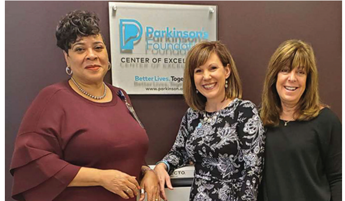
Expansion of our Global Care Network

2. Expanding Care. Living well with Parkinson's means having access to the right health care professionals, medications and services. But finding the right care isn't easy outside of our Global Care Network.