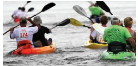
Paddles for Parkinson's planned by the Catch the Cure organization.

The Champions team is eager to provide guidance and strategy for your fundraiser. We also recommend you form a committee, who can support you during the planning period and throughout the entire event. The Parkinson's Foundation will provide you with an online fundraising page and logos for your marketing materials. We are also able to mail you brochures and newsletters so you can have them at your event. Our online store offers bracelets and shirts if you would like to purchase them for your event.