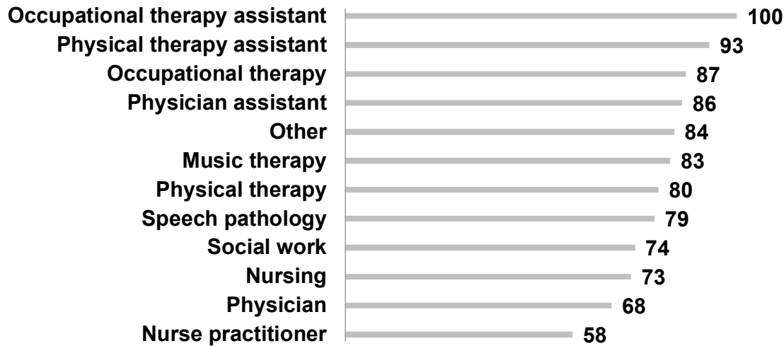
Figure 2. Proportion of professions rating half or more of ATTP information for the week as new (n=808)

professions reported at least half of the week's content as new to them, even for rehabilitation professionals (OT, PT, SLP). While MD and NP professions included more experienced PD practitioners, a substantial number (68% and 58% respectively) reported at least half of ATTP content as new.